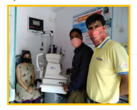
Eye camp at Nashik

By facilitating early detection of diseases through screening camps as well as by helping through secondary care to reduce the treatment cost, Equitas helps communities hailing from the "Bottom of Pyramid" to get rid of the burden of spending huge portion of their hard earned money on health problems