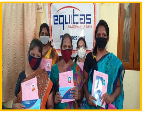
DAV Samrakshan Loan disbursement toour members in Kannigapuram ,Chennai