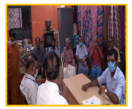
Old age members identification Work In Koyambed

(Pavement Dwellers Rehabilitation Program)