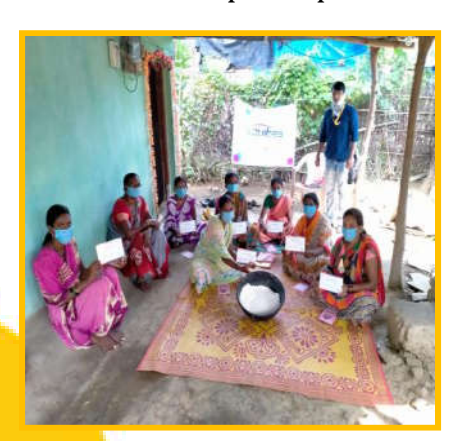
Chemical making Training at Amarayati

Equitas strives for the enhancement of quality of women's lives by providing skill trainings and empowering them to earn supplemental income. This also gives economic independence to women and ensures their participation in the economic development of our nation.