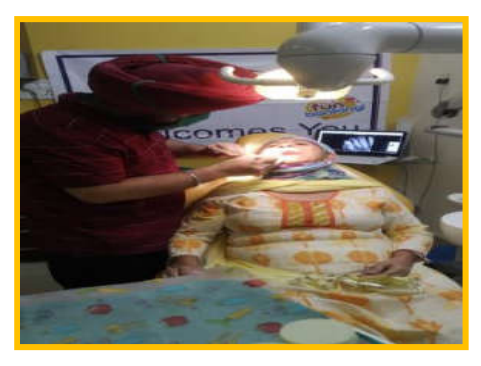
Dental Camp at Jodhpur